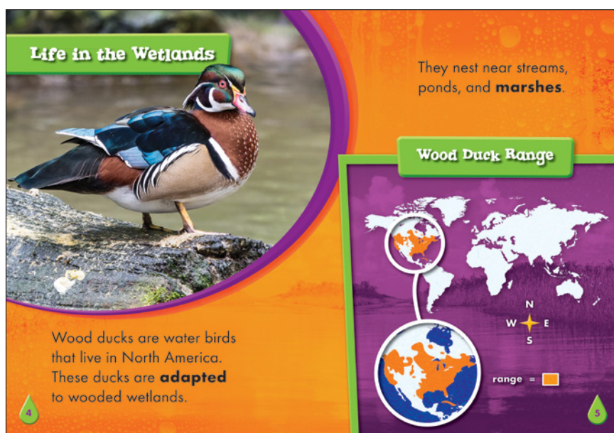
Sample spread from Wood Ducks